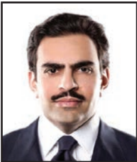
HE Sh. Abdulla bin Rashed Al Khalifa Ambassador of the Kingdom of Bahrain to the United States of America

Appointed as the Chief Executive of The Oil & Gas Holding Company in 2011 and currently Chairman of the National Oil & Gas Authority, The Oil & Gas Holding Company, The Bahrain Petroleum Co., Tatweer Petroleum and board member of 'Central Bank of Bahrain', Sh. Mohamed was appointed as the Minister of Oil on 3rd June 2016.