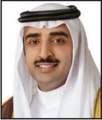
HE Sh. Mohamed bin Khalifa Al-Khalifa Minister of Oil, Kingdom of Bahrain

Sh. Mohamed bin Khalifa bin Ahmed Al-Khalifa has a B.Sc. degree from the King Fahd University of Petroleum and Minerals. Having a Master's Degree from Cambridge University and an Advanced Masters from Imperial College and holding an MBA from DePaul University, he joined the Ministry of Finance becoming Director of Shareholdings in 2005.